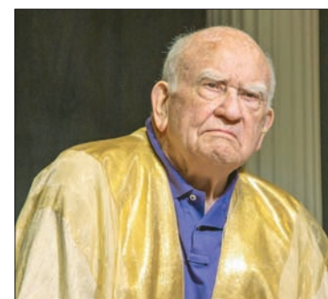
Ed Asner is God.