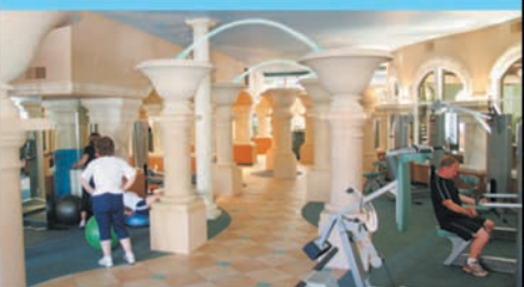
5) Fitness Promenade: Private Free Motion Cable Machines