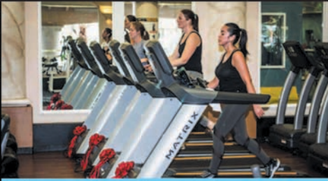
4) West Circuit Weight Room: Life Fitness, Icarian, Cybex, etc.