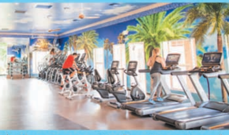
7) Sky Room Studio: Functional