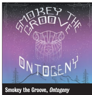
Smokey the Groove, Ontogeny

Tonight (May 23), under the umbrella of the themes of “confused wizard and two legged spider” (those who dress accordingly will win “absolutely no prizes”), local glory rockers Bungo will unveil a new single under the stars at Argus Bar + Patio . And Friday (May 24), super-sized party band Smokey the Groove will blow the funky horns for its second recording, Ontogeny , during an album-release party at Lost on Main . The high-energy crazy-maker “Lobster Bee” is the first song on the album to win me over, while “M’Kay Ultra” wins based on its hilarious title alone.