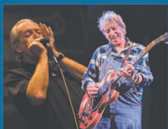
ELVIN BISHOP AND CHARLIE MUSSELWHITE