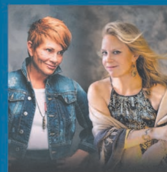
MARY CHAPIN CARPENTER & SHAWN COLVIN