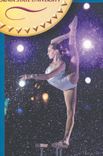
CIRQUE FLIP FABRIQUE