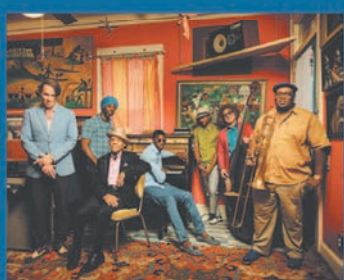
PRESERVATION HALL JAZZ BAND