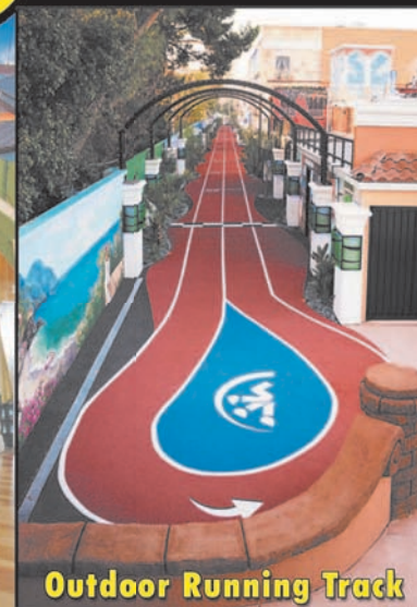
Outdoor Running Track