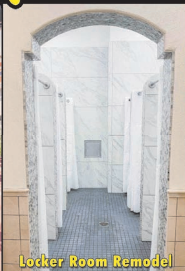
Locker Room Remodel