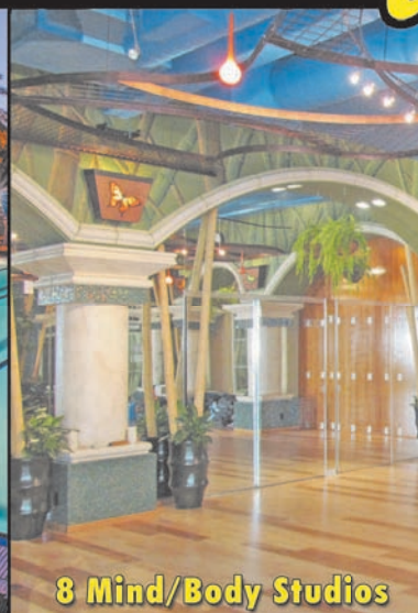
8 Mind/Body Studios