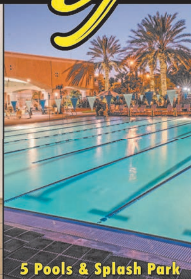
5 Pools & Splash Park