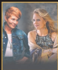
MARY CHAPIN CARPENTER & SHAWN COLVIN