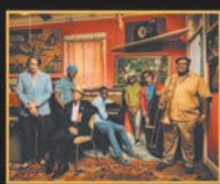
PRESERVATION HALL JAZZ BAND