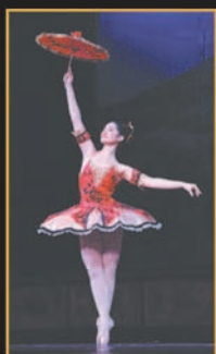
A VERY CHICO NUTCRACKER