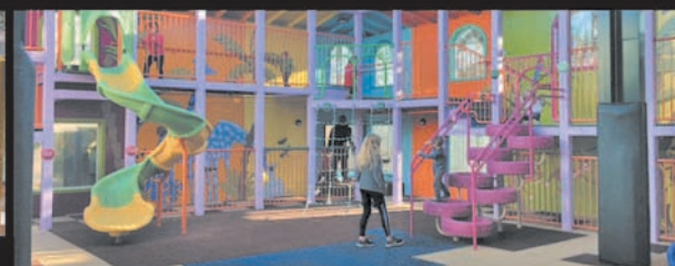
BEST PLACE FOR KIDS TO PLAY