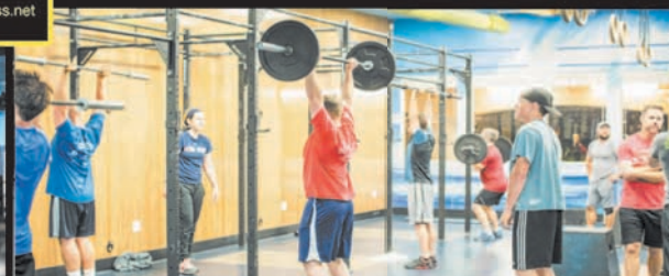
BOUTIQUE GYM - CROSSFIT STUDIOS