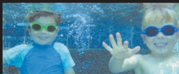
BEST PLACE FOR KIDS TO PLAY