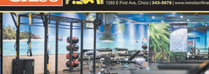
BOUTIQUE GYM - SKY ROOM