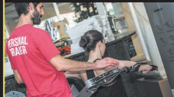
BEST PERSONAL TRAINER

IN MOTION FITNESS WHERE FITNESS IS A RESORT ♦ OPEN 24 HRS VOTED BEST HEALTH CLUB 25 YEARS RUNNING 1293 E First Ave, Chico | 343-5678 | www.inmotionfitness.net