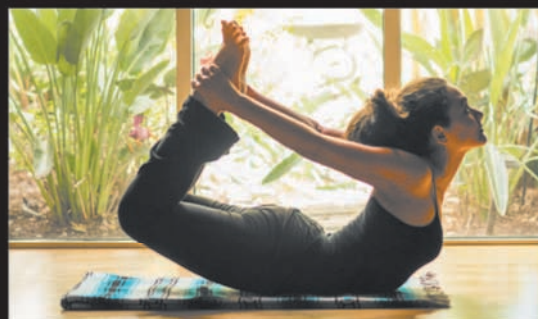
BEST YOGA STUDIO

DEEP APPRECIATION TO OUR MEMBERS For voting In Motion Best of Chico 25 Years!