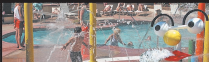
BEST PLACE FOR FAMILY FUN