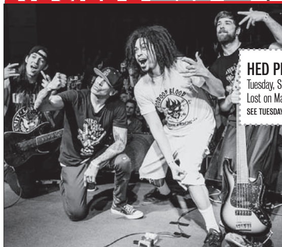
HED PE Tuesday, Sept. 17 Lost on Main SEE TUESDAY