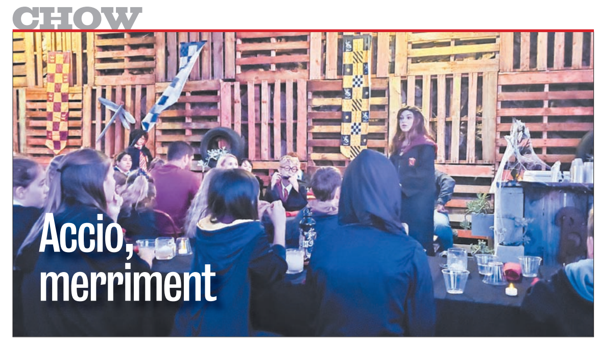
Little wizards listen to Hermione tell 'The Tale of the Three Brothers.'