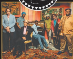
PRESERVATION HALL JAZZ BAND