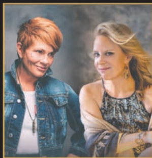
MARY CHAPIN CARPENTER & SHAWN COLVIN