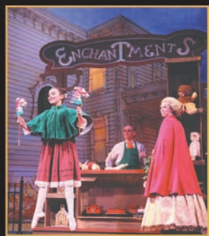
A VERY CHICO NUTCRACKER