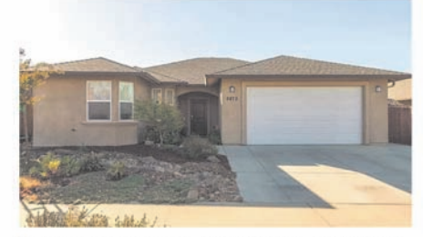
Better Than New | 3 Bd/2 Ba | $419,900 2873 Longwood Dr.

DUFOUR REALTY CalDRE #00848849. Each Office is Independently Owned and Operated.