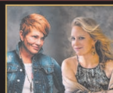
MARY CHAPIN CARPENTER & SHAWN COLVIN