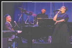
WE SHALL OVERCOME