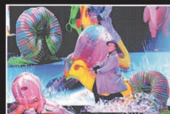
B-THE UNDERWATER BUBBLE SHOW