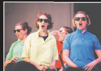
THE SECOND CITY