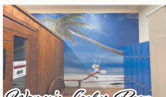
Women's Locker Room

ALL 5 POOLS AND JACUZZI SPAS REPLASTERED, 30 NEW SKYLIGHTS