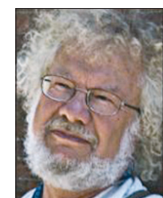
by Donald Heinz The author is a retired Chico State professor and the author of Beyond Trump: Achieving a New Social Gospel .

Did Republicans buy the evangelicals or the evangelicals take over the Republican Party? Each side gained. Evangelicals got the appointment of conservative judges; an unflinching rejection of abortion and the promise to revoke Roe v. Wade; a gradual de-privileging of homosexuality and gay marriage; and an activist guarantee of freedom of religion, including government support of religious schools and religious symbols in the public square and the withdrawal of prosecution of religious prejudice against homosexual and other liberal civil rights.