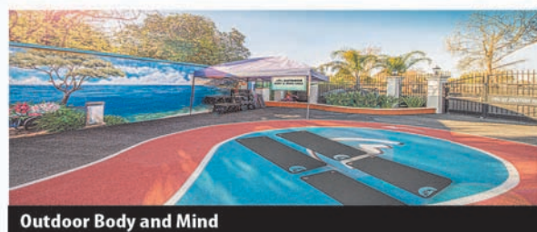
Outdoor Body and Mind