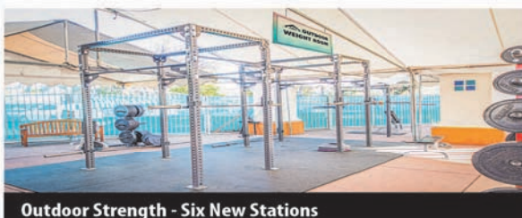
Outdoor Strength - Six New Stations