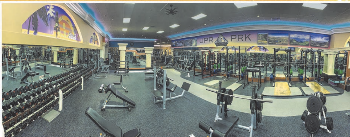
8+ Strength Training Areas - Main Free Weight Room Remodeled

Girls, Boys, Women, Men, Teens, Seniors - Everyone, Everywhere