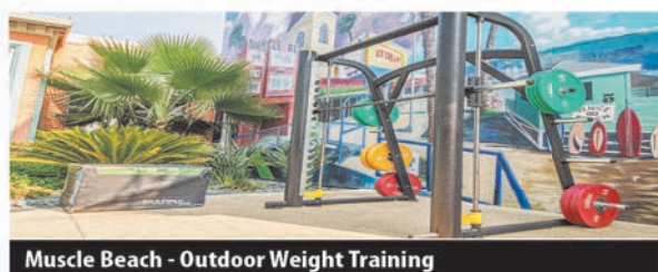
Muscle Beach - Outdoor Weight Training