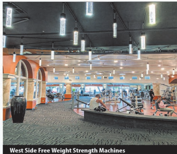
West Side Free Weight Strength Machines

Simply open your camera and focus on QR code to watch video.