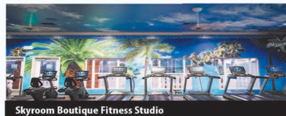
Skyroom Boutique Fitness Studio