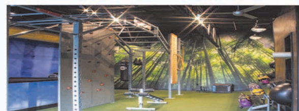
Southside Boutique Fitness Studio