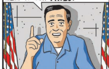
The Basement Patriot Podcast

JOE BIDEN LOVES FACE MASKS SO MUCH--IT'S ONLY LOGICAL TO ASSUME HE WANTS TO SURGICALLY ATTACH THEM TO OUR FACES!