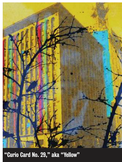
"Curio Card No. 29," aka "Yellow"