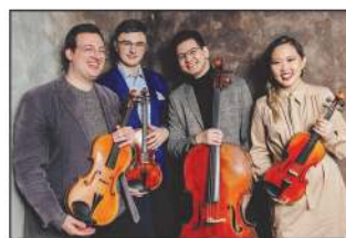
The Balourdet Quartet

Tickets Now On Sale www.chicoperformances.com