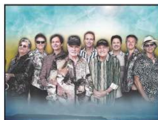
The Beach Boys