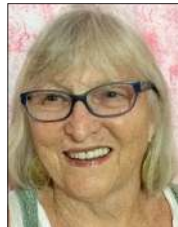
by Susan Tchudi

V alley's Edge, the enormous (1,448 acres) sprawl project east of Bruce Road, would forever change the character of Chico. With over 2,700 housing units and a projected population of over 5,000 people, this proposed development rivals the size of Durham.