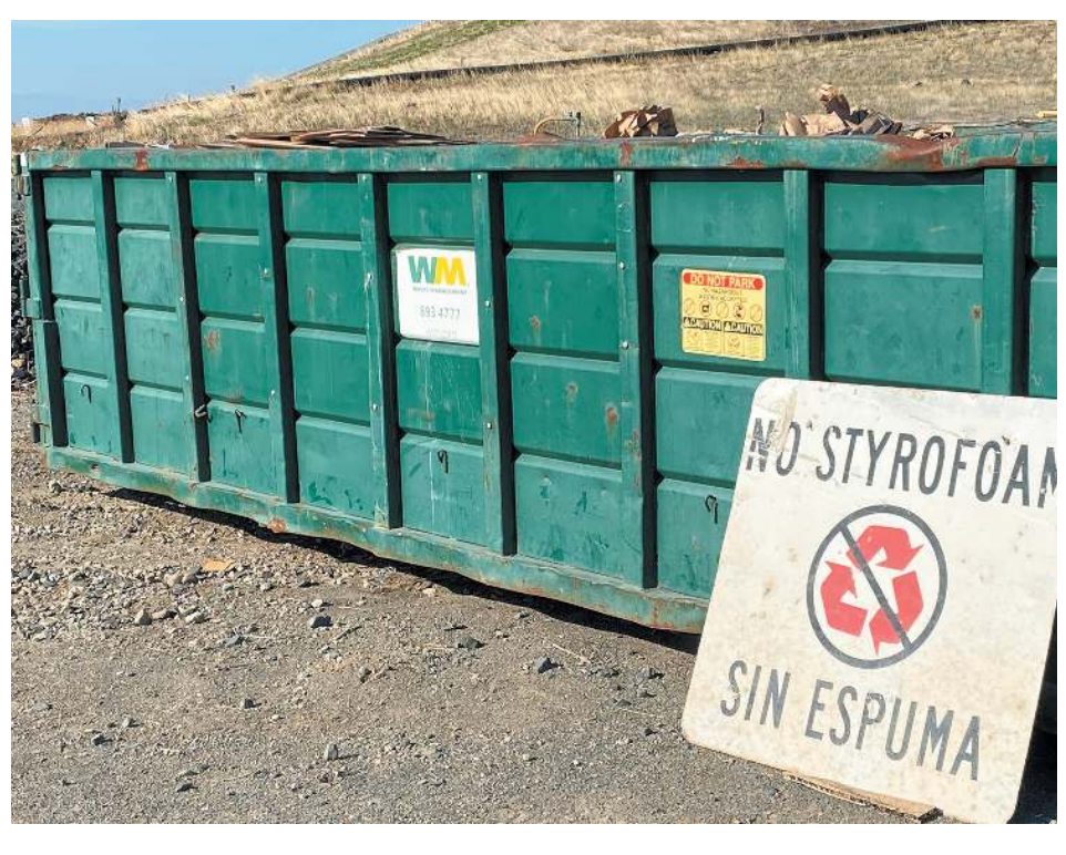
Self-service recycling bin at the NRRWF which accepts flattened cardboard only. NRRWF cannot recycle Styrofoam, plastic shrink wrap, or bubble wrap.

Northern Recycling and Waste Services will accept