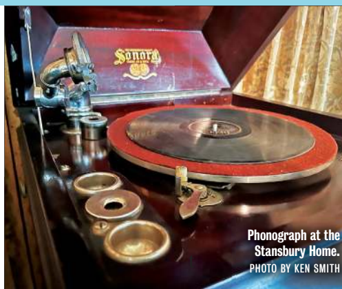
Phonograph at the Stansbury Home.

The knowledgeable docents do a great job of honoring the home's early residents and sharing details of their lives. It's open for public tours on weekends and hosts two annual events: an ice cream social in the summer and a Victorian Christmas during the holidays. For more info, go to thestansburyhome.com .