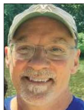
by Eric Nilsson

A town the size of Gridley thrust up into the foothills on the east side of Chico, destroying valuable animal and plant habitat, eliminating mature oak trees,