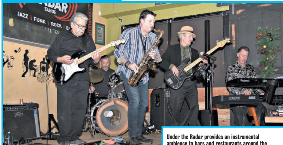
Under the Radar provides an instrumental ambience to bars and restaurants around the Truckee Meadows.