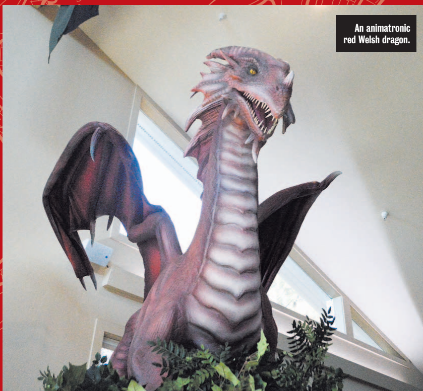
An animatronic red Welsh dragon.