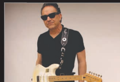
JIMMIE VAUGHAN WITH SPECIAL GUEST COCO MONTOYA April 12, 2019