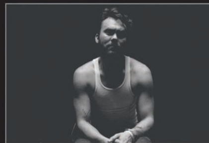
SHAKEY GRAVES WITH CAMERON NEAL March 17, 2019