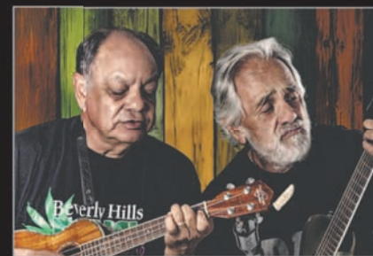
CHEECH & CHONG WITH SPECIAL GUEST SHELBY CHONG March 23, 2019