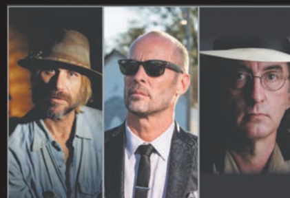
TODD SNIDER, PAUL THORN & JAMES MCMURTRY April 6, 2019