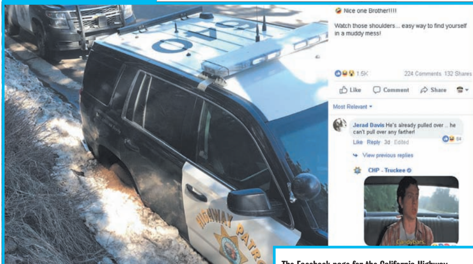
The Facebook page for the California Highway Patrol's Truckee division mixes humor with important information for the community.