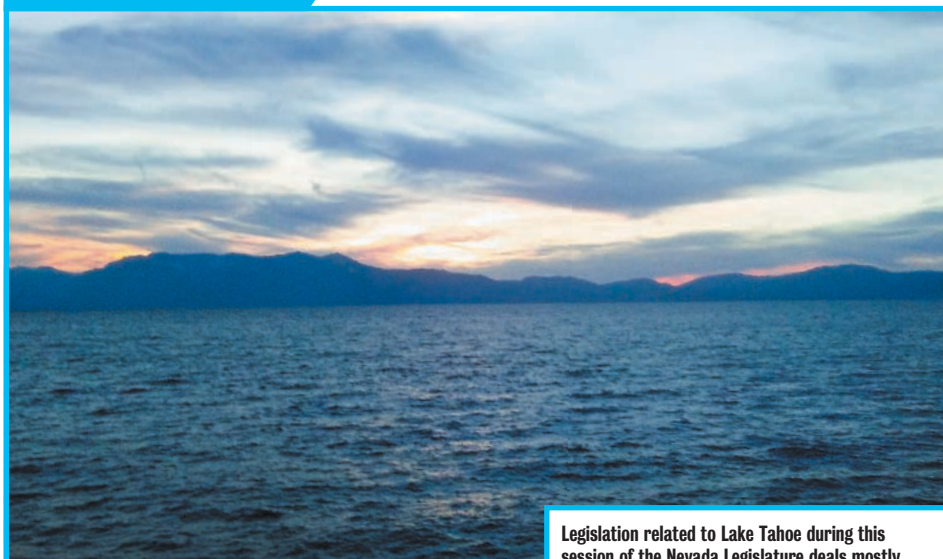
Legislation related to Lake Tahoe during this session of the Nevada Legislature deals mostly with environmental issues.