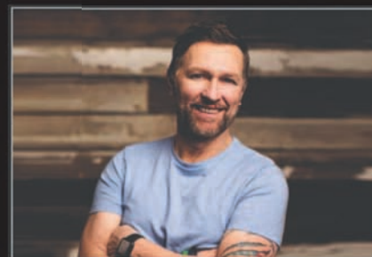
CRAIG MORGAN July 5, 2019