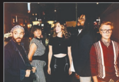
LAKE STREET DIVE August 14, 2019