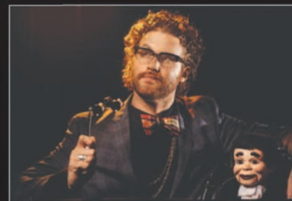
T.J. MILLER June 28, 2019