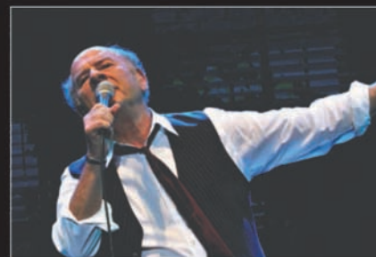
ART GARFUNKEL: IN CLOSE-UP May 11, 2019