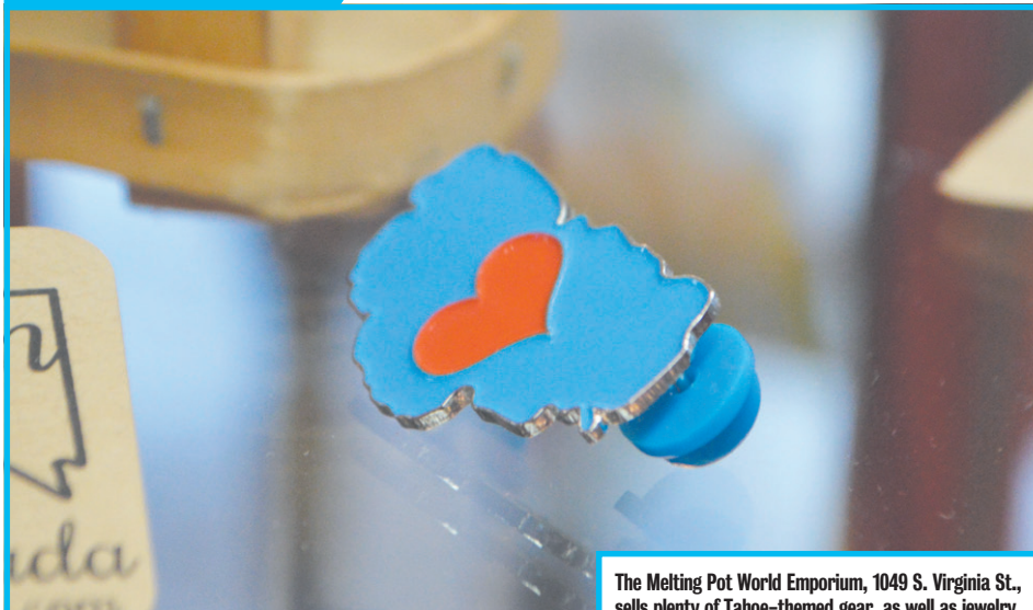
The Melting Pot World Emporium, 1049 S. Virginia St., sells plenty of Tahoe-themed gear, as well as jewelry and clothing designed by Lake Tahoe artists.