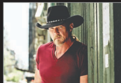
TRACE ADKINS July 6, 2019