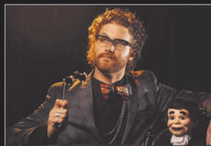
T.J. MILLER June 28, 2019