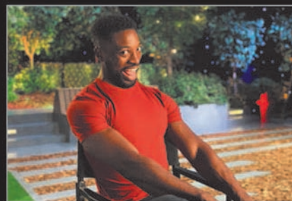
PREACHER LAWSON FROM AMERICA'S GOT TALENT May 31, 2019