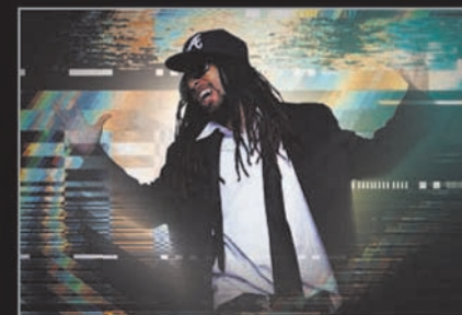
LIL JON June 7, 2019