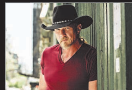
TRACE ADKINS July 6, 2019