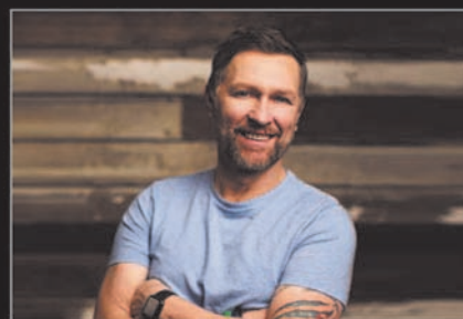
CRAIG MORGAN July 5, 2019