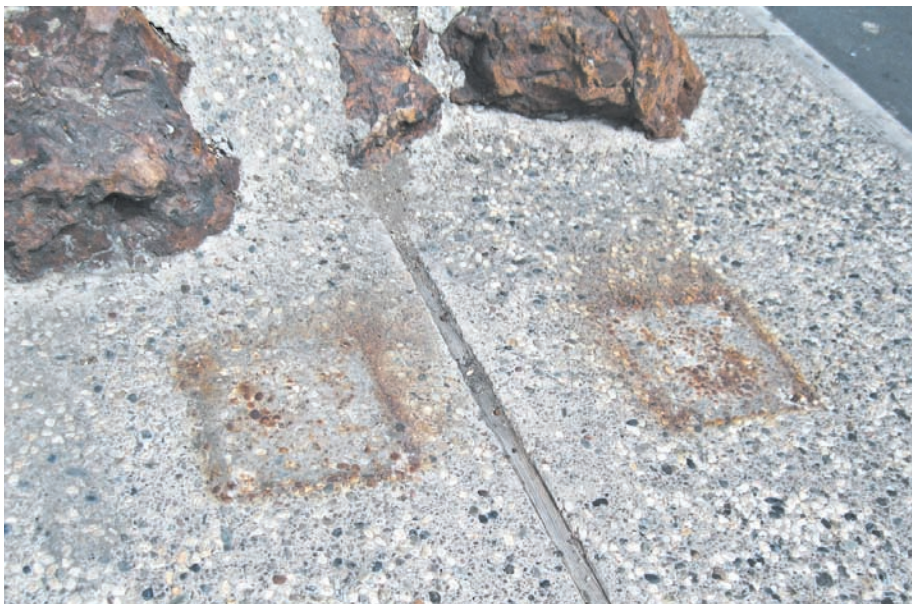
A melancholy mark for journalists—the imprint of the pedestals for a newspaper rack that, until this month, stood next to a Plumb Lane restaurant and contained compartments for six newspapers. The rack has been unbolted and removed.