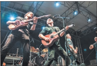
The Young Dubliners Aug. 31, 7 p.m. The Saint 761 S. Virginia St. 221-7451