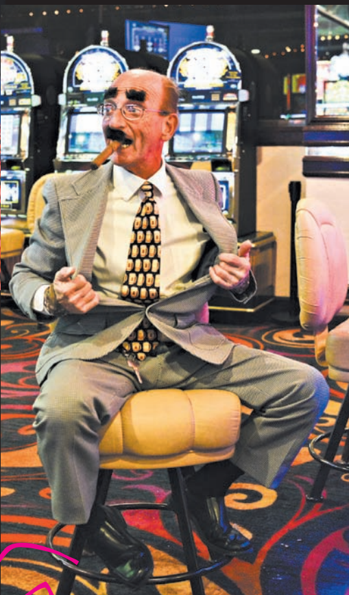
▶ Groucho Marx was happy to show off for the camera while playing slots on the ground floor of the Eldorado—one of thousands of creepy customers who made themselves comfortable on the gaming floors.