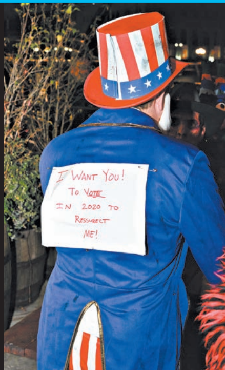
◀ Zombie Uncle Sam made a nod to the current state of national politics on the veranda outside of Ole Bridge Pub, 50 N. Sierra St.