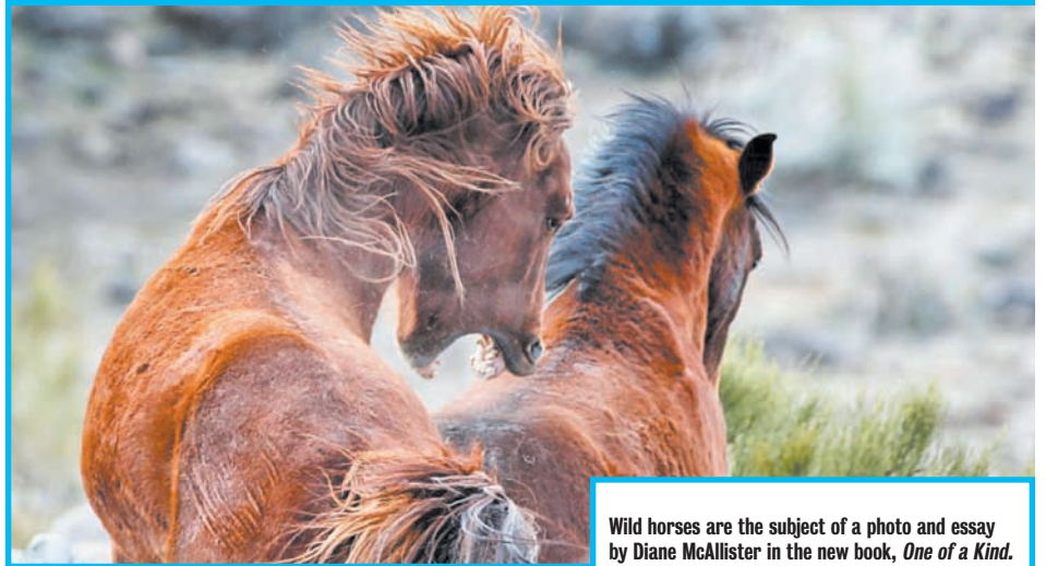
Wild horses are the subject of a photo and essay by Diane McAllister in the new book, One of a Kind .