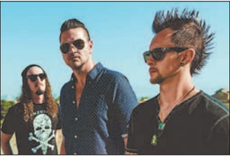
Adelitas Way Jan. 4, 8 p.m. Virginia Street Brewhouse 211 N. Virginia St. 433-1090