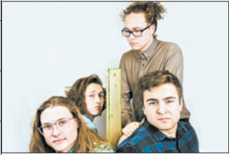
Dogleg Feb. 1, 7:30 p.m. The Holland Project 140 Vesta St. 448-6500