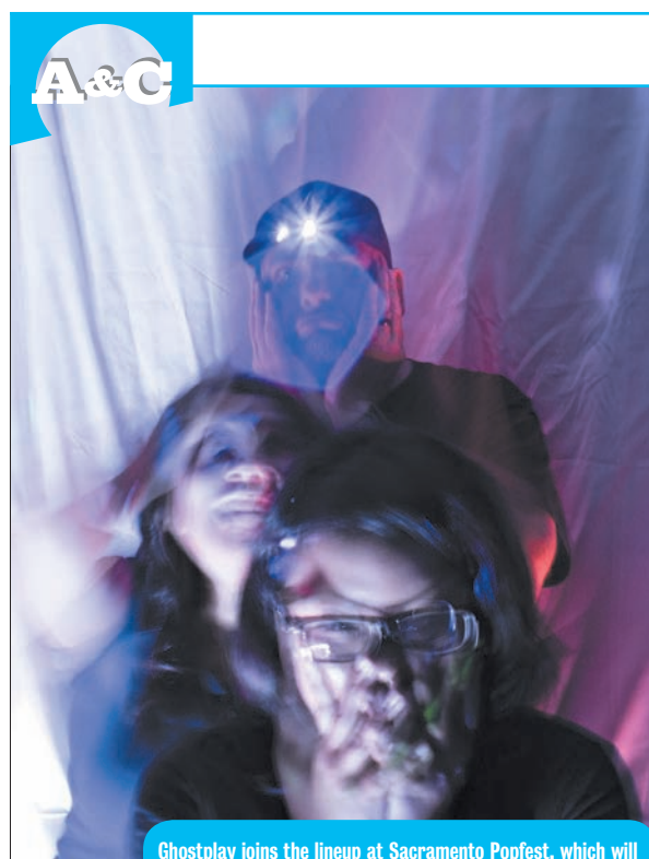
Ghostplay joins the lineup at Sacramento Popfest, which will bathe Old Ironsides in dreamy soundscapes.