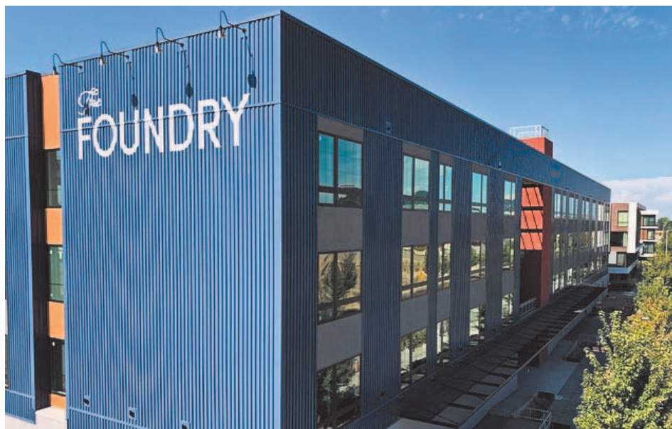
The Foundry apartments in The Bridge District are opening soon.