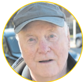
Last year, my daughter and her family went as emojis. It was simple to make. There's five of 'em so they could all have a different one.